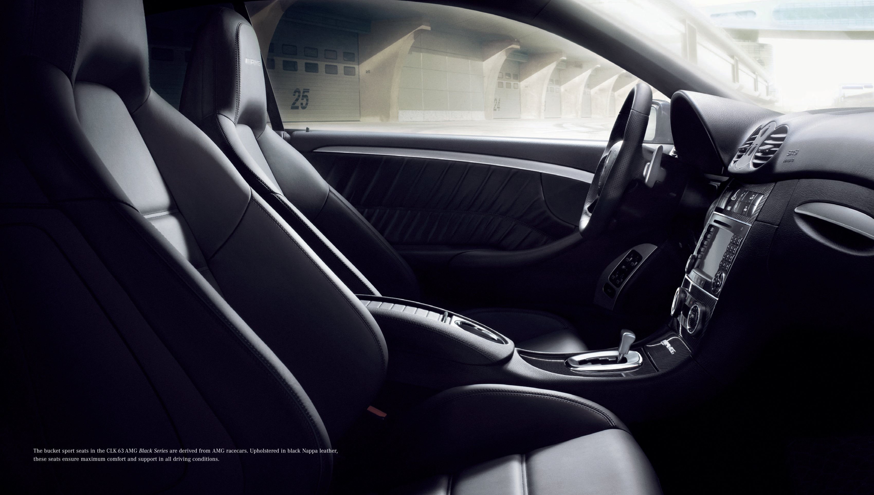
The bucket sport seats in the CLK63 AMG Black Series are derived from AMG racecars. Upholstered in black Nappa leather, these seats ensure maximum comfort and support in all driving conditions.